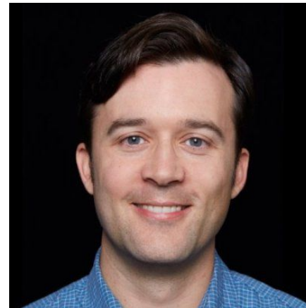
Audun Utengen @audvin