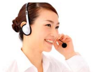
Call Center Capabilities