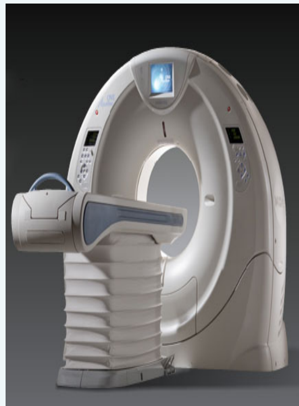
Aquilion One 320-Slice CT Scanner