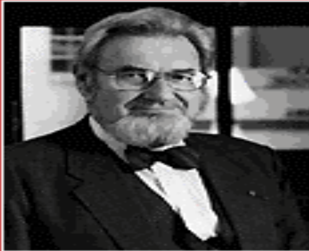
C. Everett Koop M.D. Chairman, drkoop.com