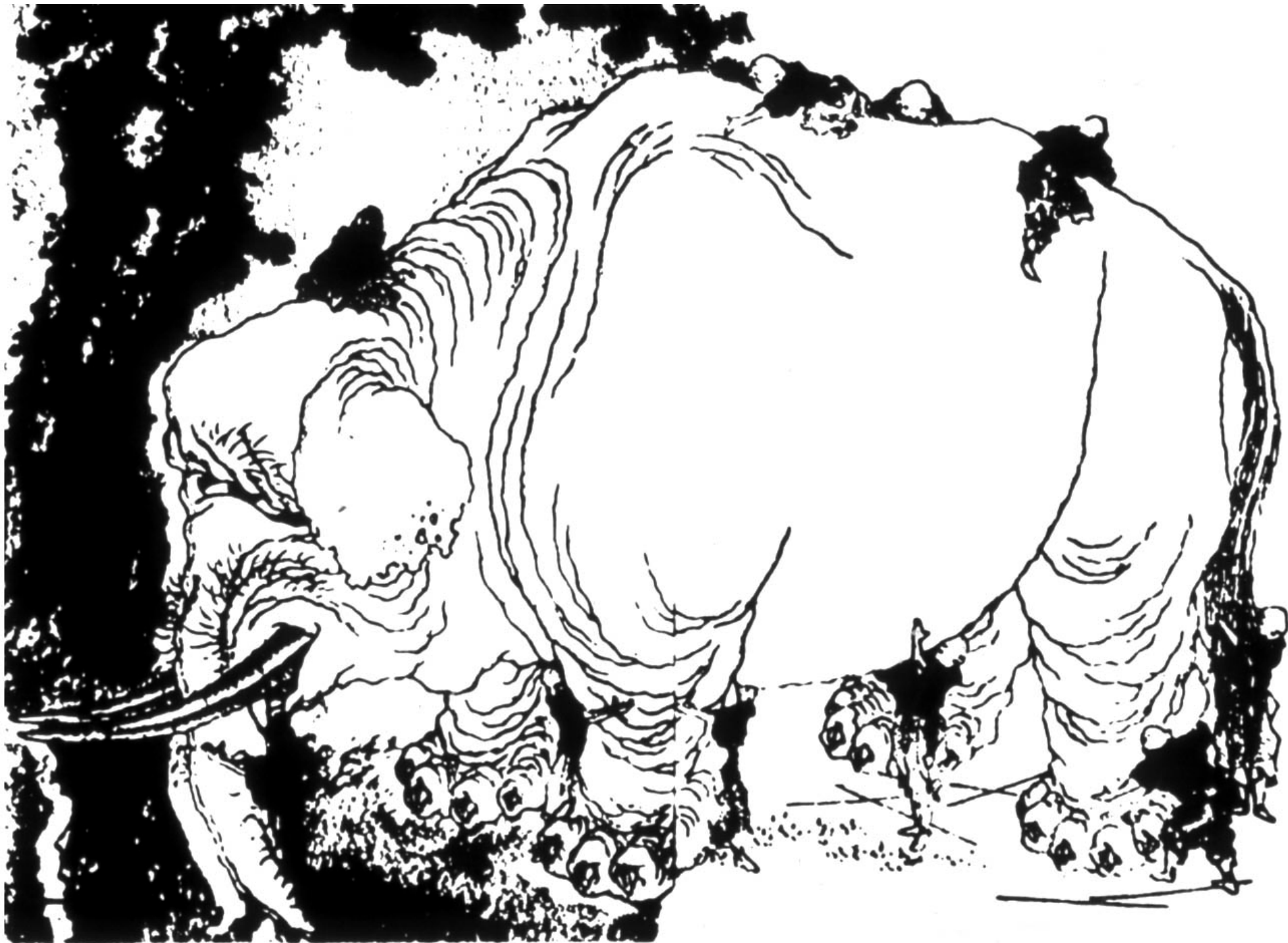
Katsushika Hokusai: A group of blind men investigating an elephant. From Hokusai Manga, Volume VIII.