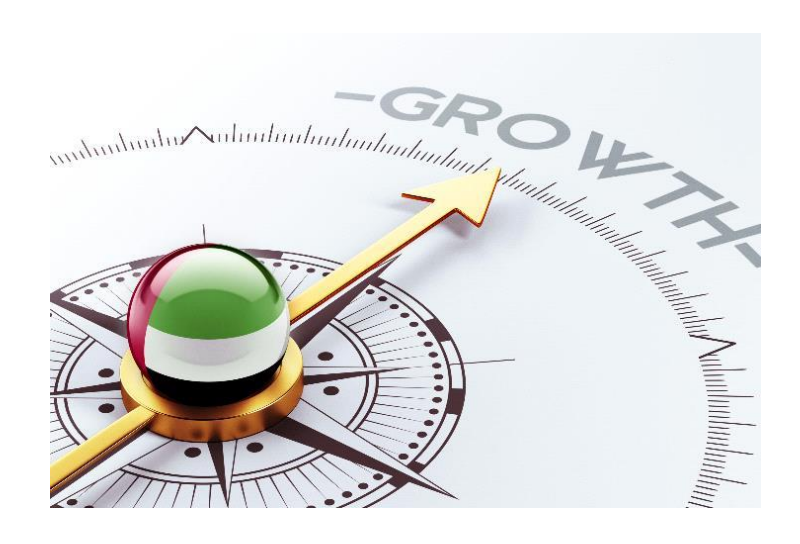
Impact on priorities