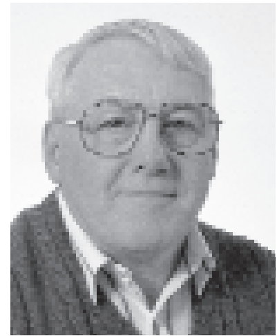
Evan Will Pay

Compare that amount to the $4,850 Evan would have paid without Medicare's prescription drug coverage—he saved $1,116 .