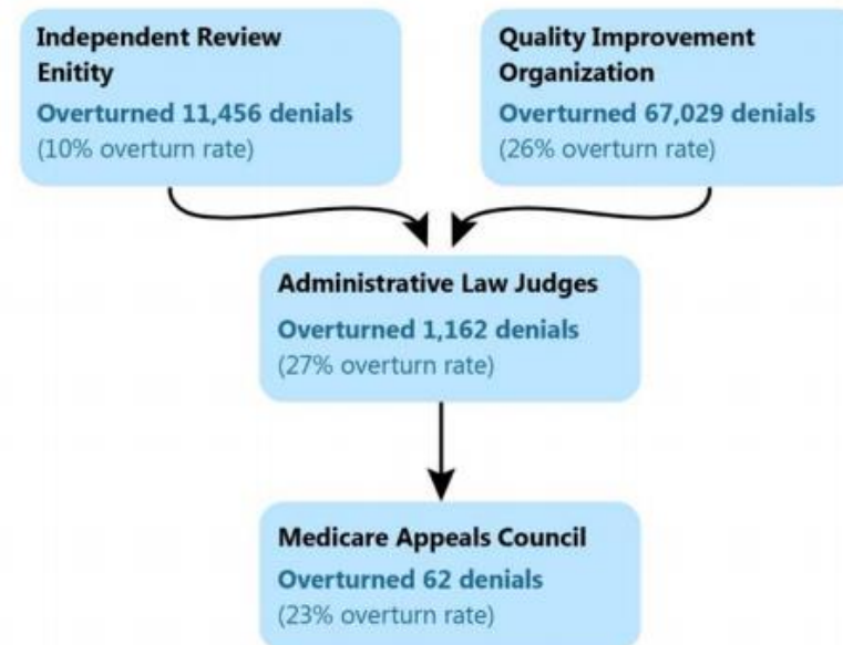
Exhibit 4: During 2014–16, independent reviewers overturned nearly 80,000 denials in favor of beneficiaries and providers.